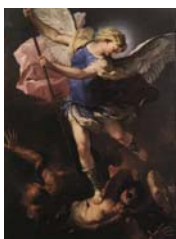
St. Michael the Archangel, defend us in battle.

The Knights of Columbus Council 13366 will not meet Sept. 4 because of the Labor Day holiday weekend. Instead, it will meet Sunday, Sept. 11. The council meets on the 2nd floor of the religious education building.