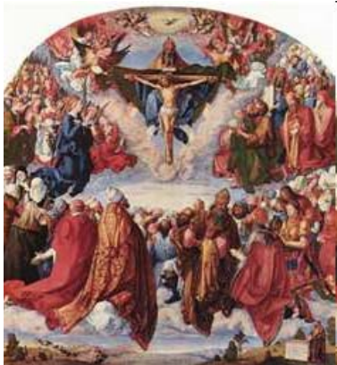
Life is changed, not taken away.