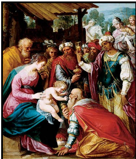
Giuseppe Cesari, called "Il Cavalier d'Arpino" (1568-1640) Italian ADORATION OF THE MAGI, around 1600-1610.